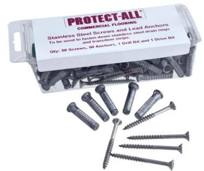
SS Screws & Anchors