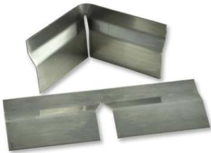
Z-Bar Inside Corner