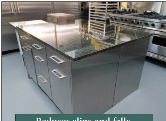
Reduces slips and falls.